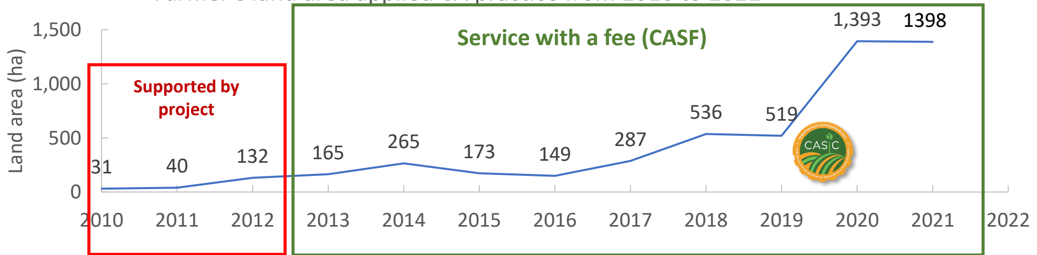
Farmer's land area applied CA practice from 2010 to 2021