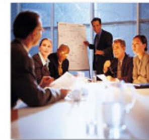
ENTAM TWG Thechnical Working Group