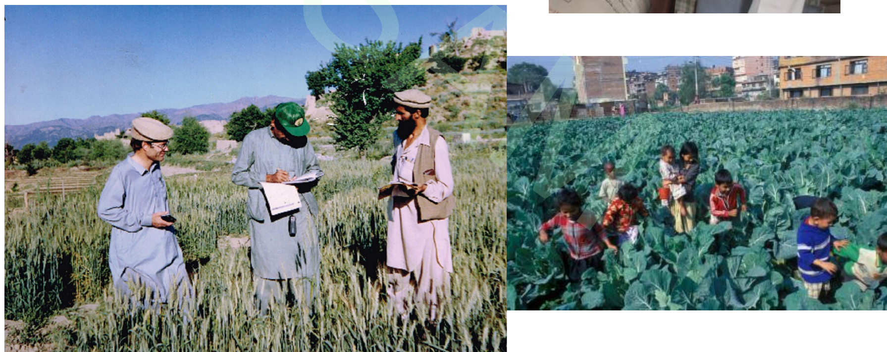
Regional Forum 2013 (un-csam.org)