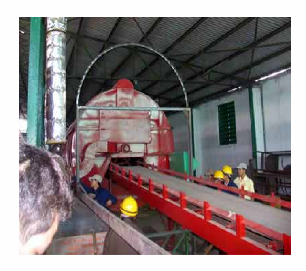
Fig. 7. Plant for manufacturing microorganism fertilizer