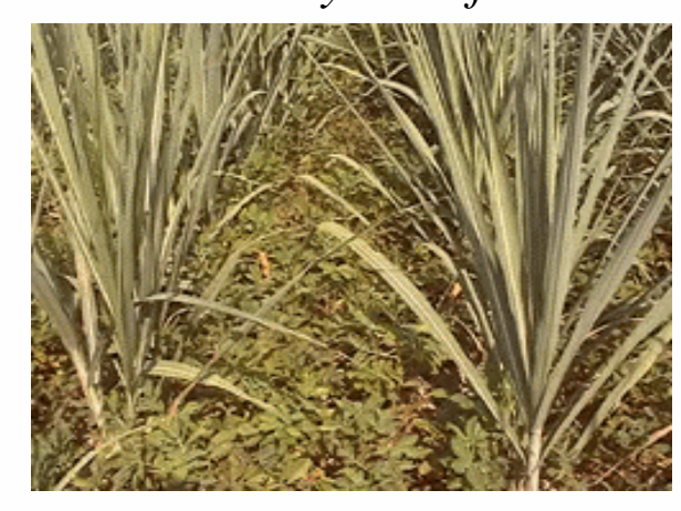
Fig. 3. Peanut is intercropped to sugarcane