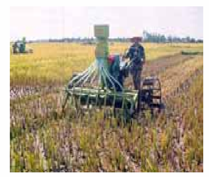
Fig. 1. Sowing soybeans directly to the rice field without tillage, just after rice harvested