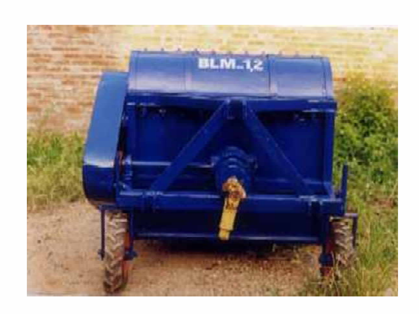
Fig. 4. Sugar-cane-leaf rotary chopper BLM-1.2