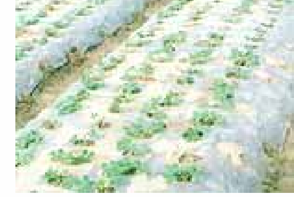
Fig. 2. Peanut is mulched by PVC film