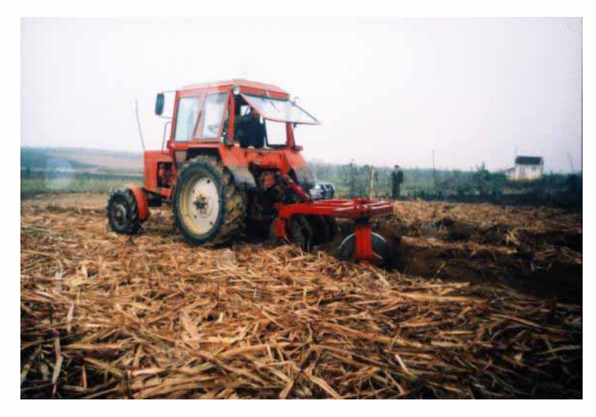
Fig. 5. Deep chisels XS-1.2