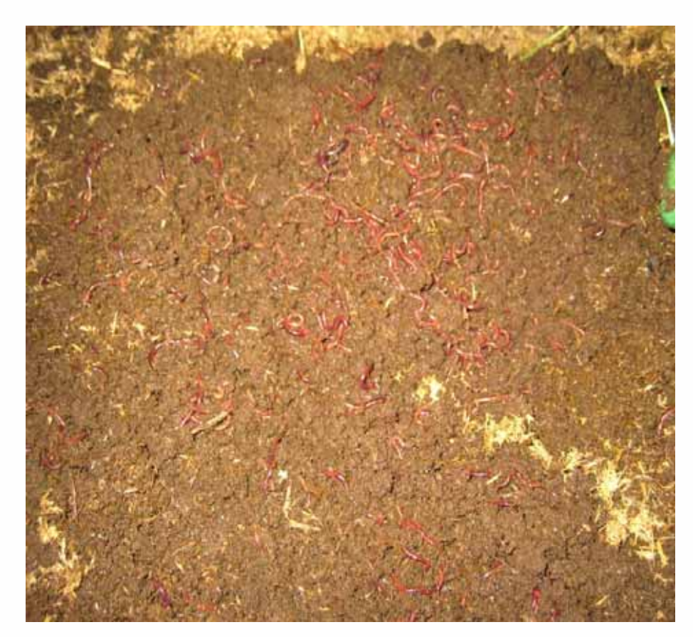
Fig. 6. Keeping earth-worm to improve soil quality and to add nutrients for animals

□ Recently, VIAEP has applied a model of earth-worm keeping to treat agricultural waste, to make the soil more fertile and the worm itself to be added as edibles for raising of pig, chicken, fish, tortoise, eel, etc.