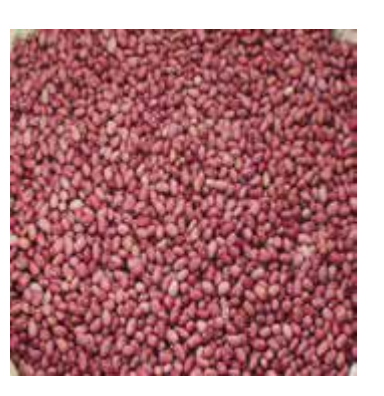
Kidney bean Pink seed, can harvest more than three times