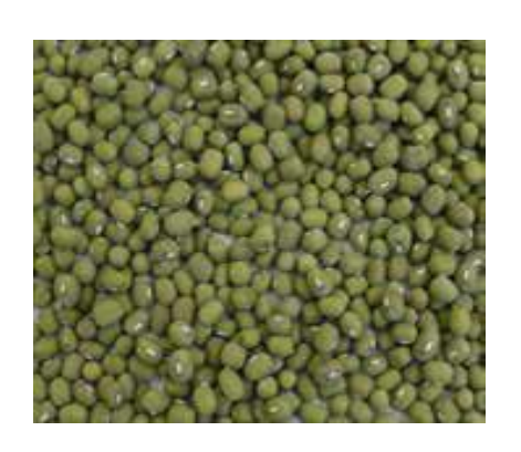
Mung bean, Dull green seed coat, potential for second harvest