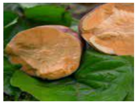
131% Orange flesh, moist texture, very high in vitamin A, sells for a good price