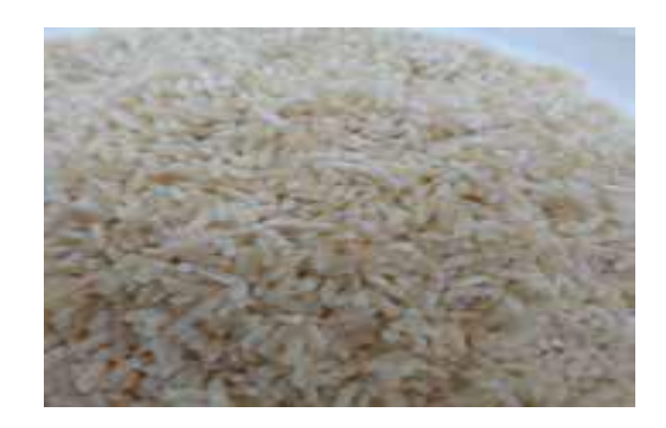
Rice White, aromatic, earlier to mature than the other Nakroma