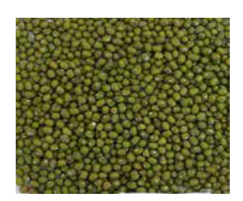
Mung bean, Shiny green seed coat, harvest once