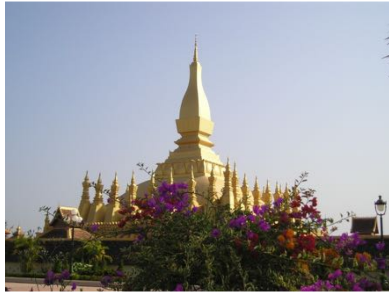
ThatLuang temple in 15 th century