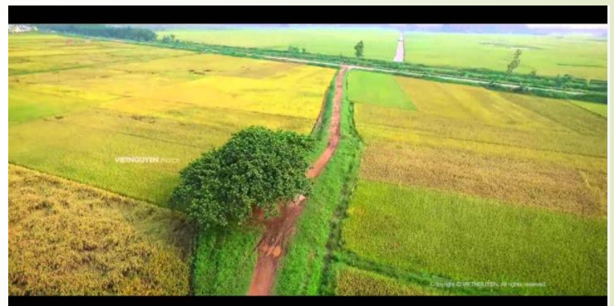
field in southern Vietnam

At present, Northern Vietnam has 70 million plots, each household has only 0.7 ha of cultivated land, including 3-4 plots. Although there is a policy of "consolidation of land plots", in general the situation is still scattered common. This limited the introduction of mechanization into the cultivation and harvesting stages.