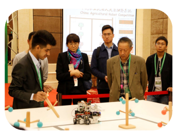
Engagement of youth