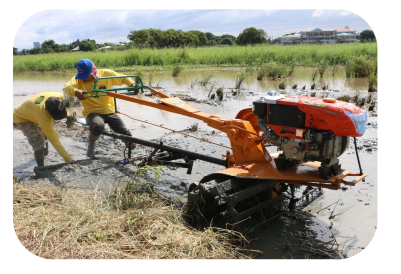
Asian and Pacific Network for Testing of Agricultural Machinery (ANTAM)