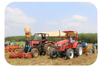
Regional Council of Agricultural Machinery Associations (ReCAMA)