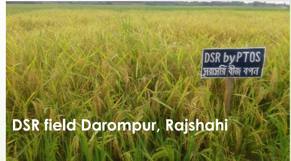
DSR field Darompur, Rajshahi