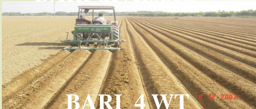
BARI 4 WT